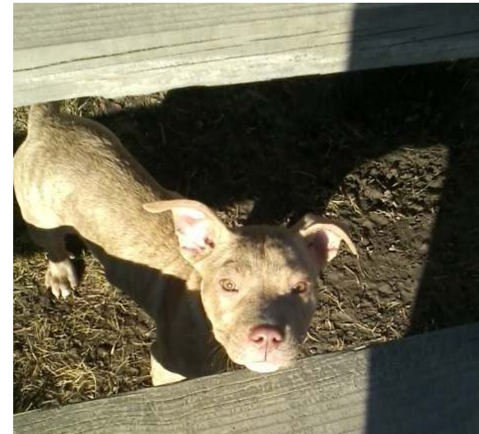
Hope trying to figure out how to get on the picnic table ...