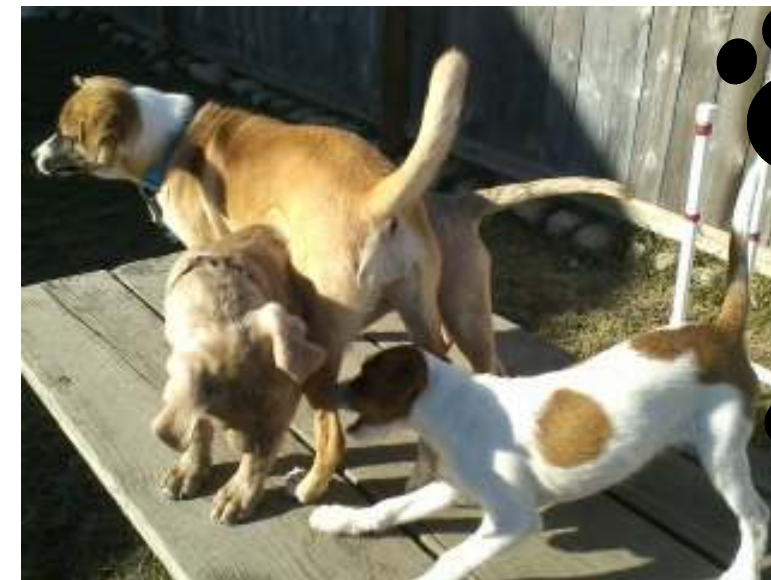
Success! Hope finally gets on the picnic table and the puppy mosh pit begins!