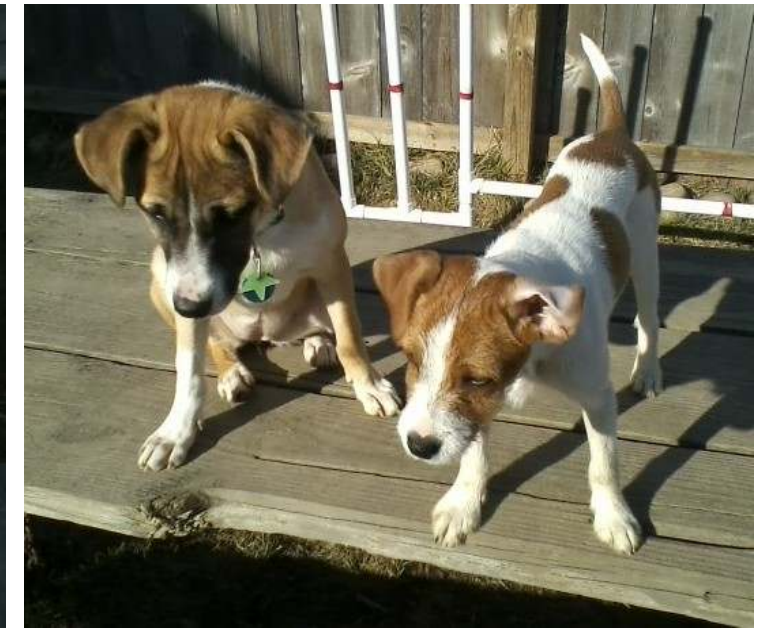
Two shelter friends watch Hope trying to figure out how to join them on the picnic table ...