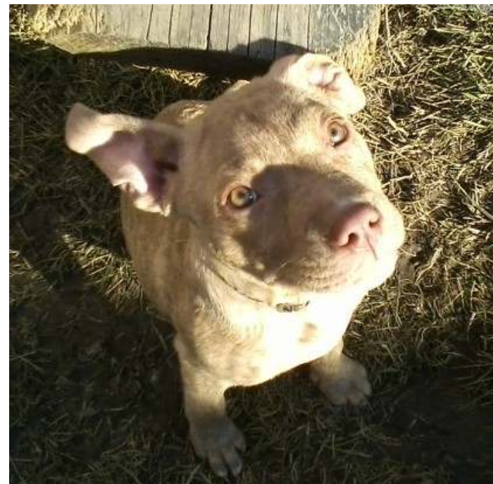
Hope hoping to be picked up ...